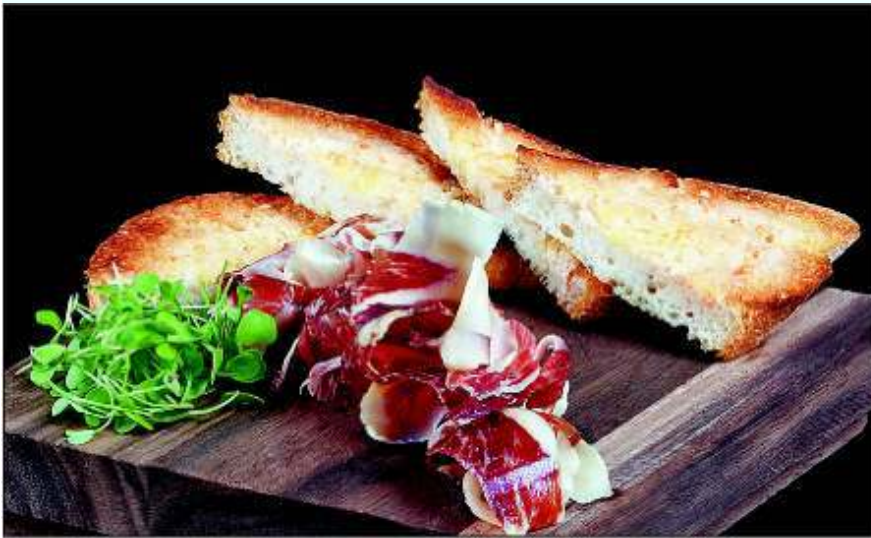
Iberico ham is on the menu at the new Prive 249

"Once you have tried this Spanish ham everything else will seem inferior."